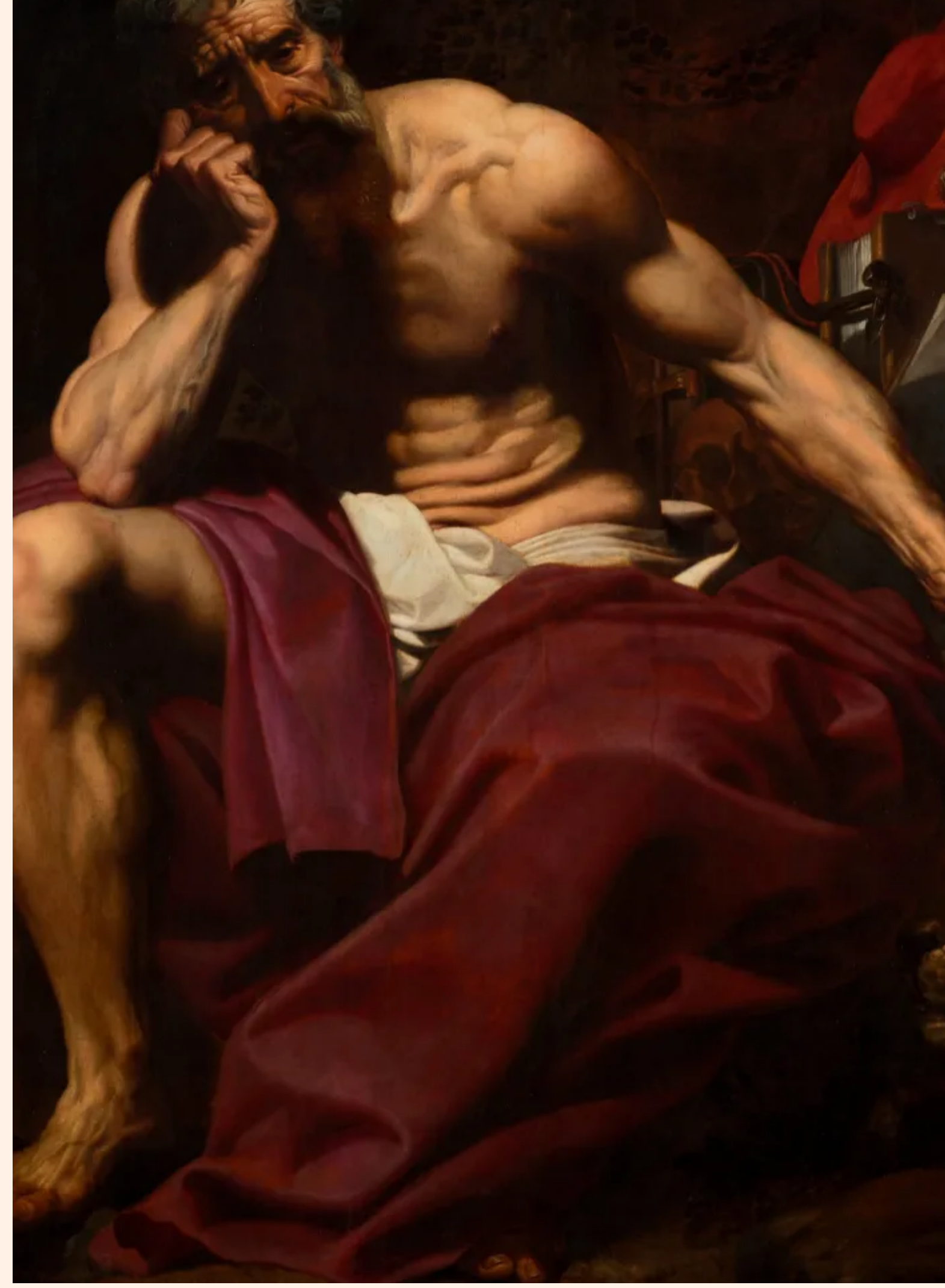
the other by Abraham Janssen