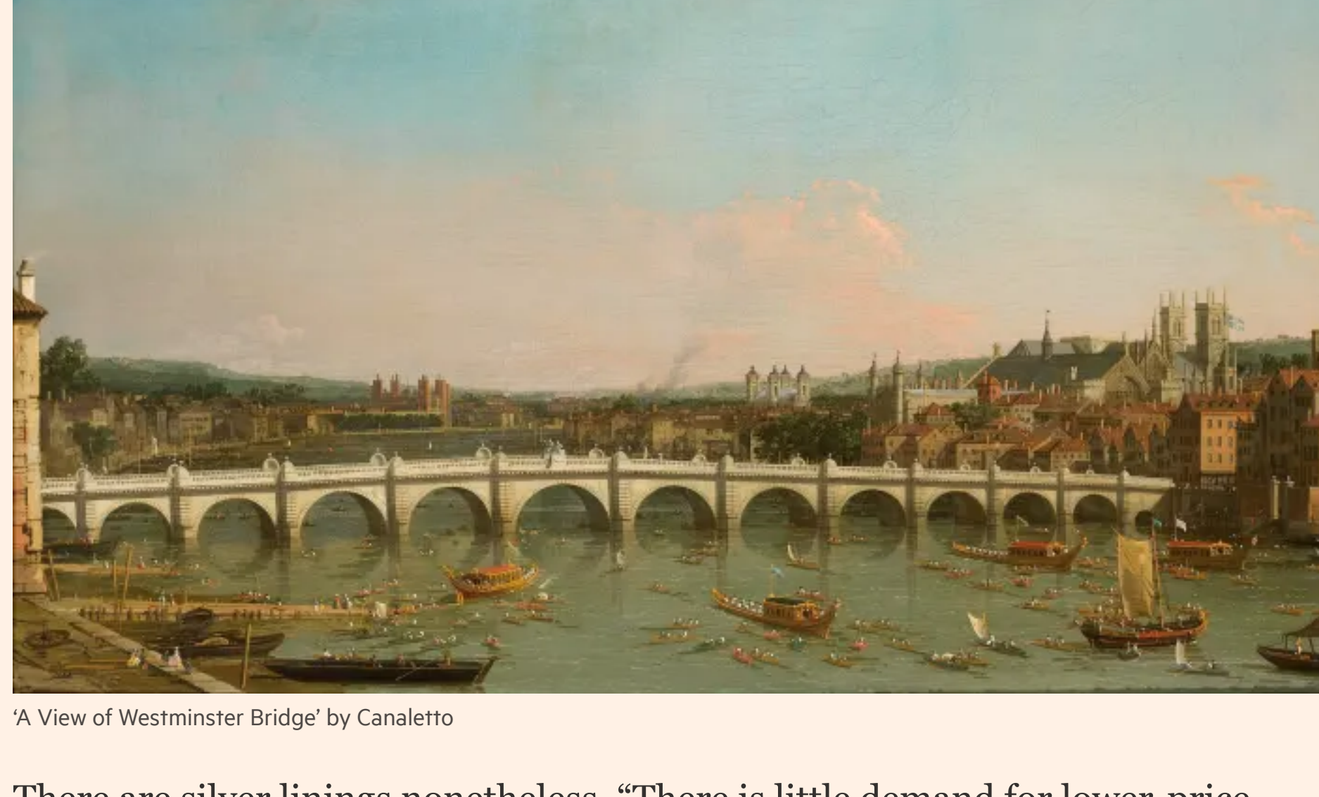
'A View of Westminster Bridge' by Canaletto

London dealer Charles Beddington says many great paintings still see the light every year. However, he stresses a curious attitude among collectors: "The lower the price range, the less demand there is." At Tefaf he is offering "A View of Westminster Bridge" by Canaletto, which shows the Lord Mayor's procession on the Thames on May 25 1750. "This is one of the most significant views of London in the 18th century ever likely to surface on the market," he says. Yet it is only priced at €3.2mn.