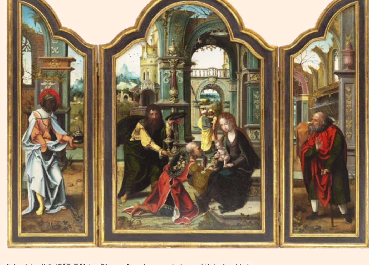
'The Adoration of the Magi' (c1525-30) by Pieter Coecke van Aelst at Nicholas Hall