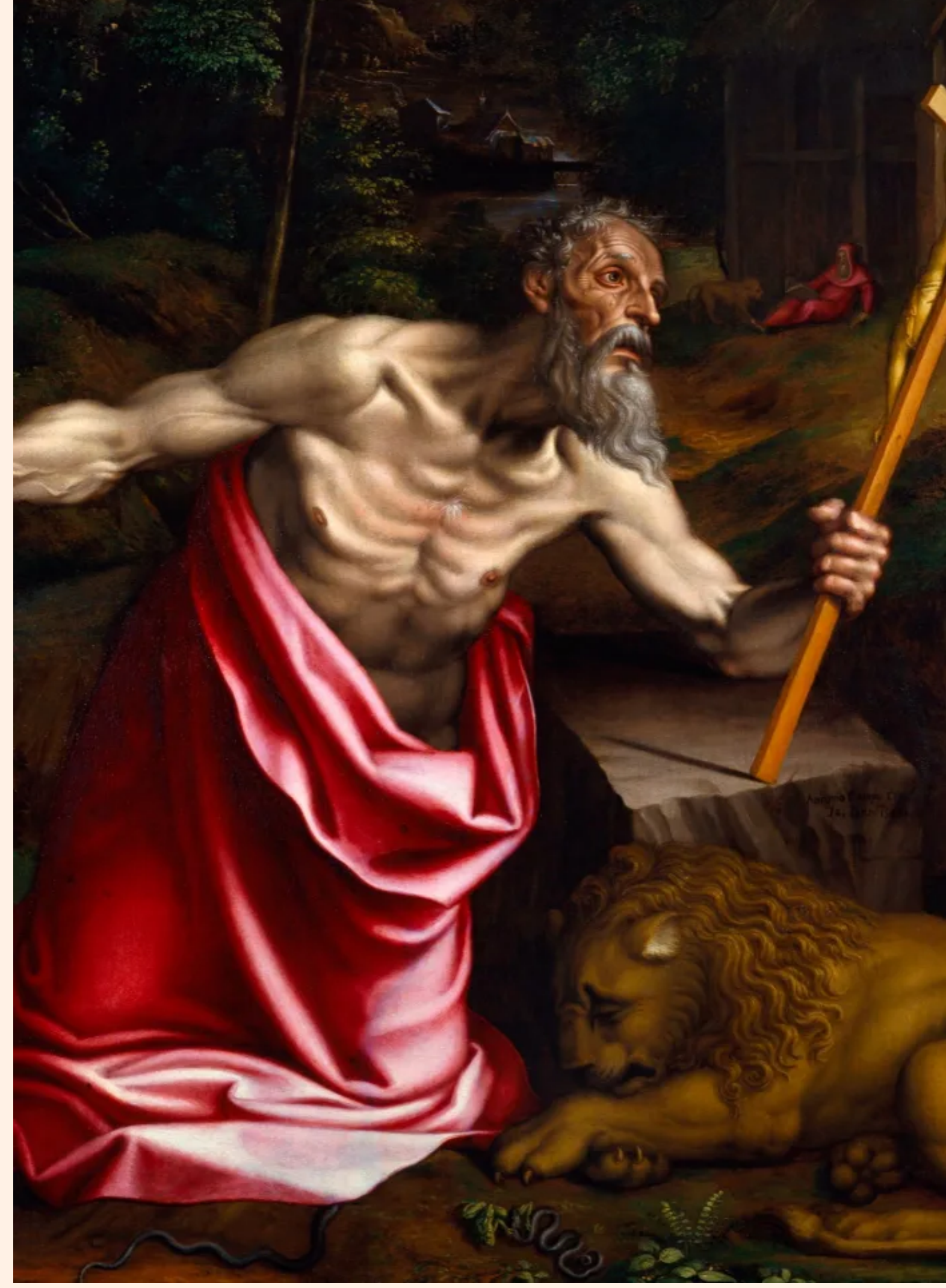
Saint Jerome in two versions, one by Antonio Campi...